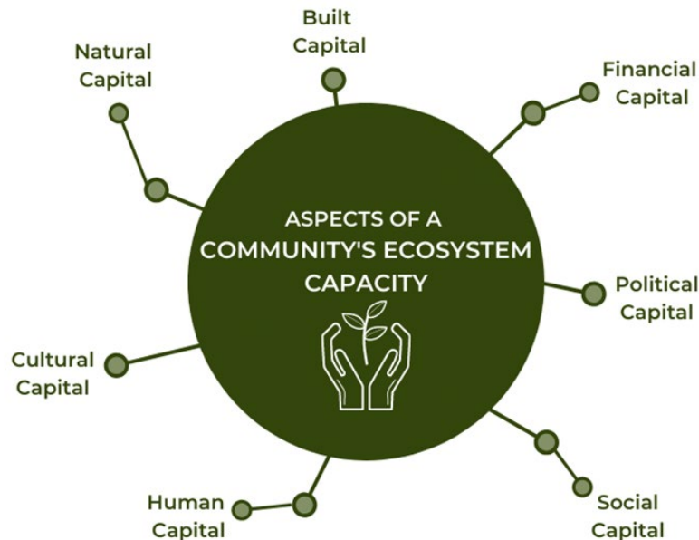
Figure 1. Community Capitals Framework