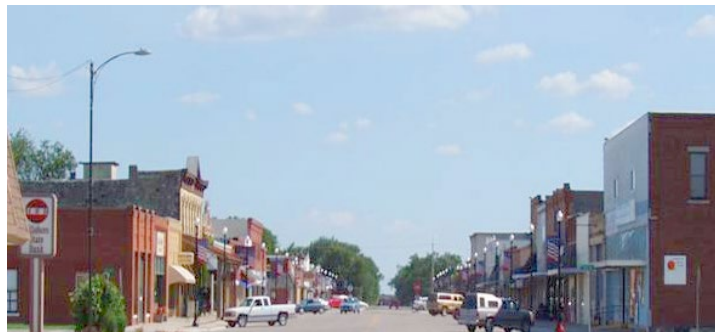
Downtown Hillsboro, Kansas

Many communities in America, and particularly rural communities, have a history of socio-economic similarity. On the surface, a rural community that is 98 percent white seems to have little diversity, but given the historical homogenous culture of this community, diversity, and marginalization, including access to venture financing, diversity manifests itself based on those who are in versus those who are out of the perceived mainstream or accepted residents of a community. Growing an entrepreneurial ecosystem that creates level playing fields and provides pathways for all entrepreneurial talent to grow is paramount.